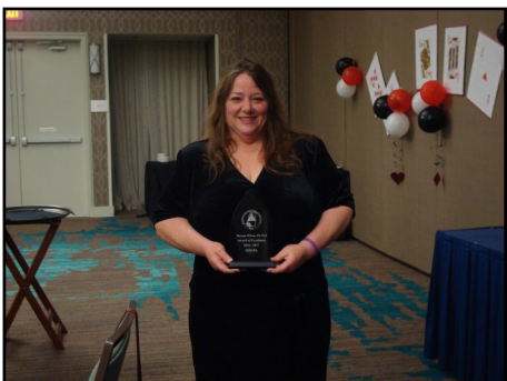
Award of Excellence Statewide Winner