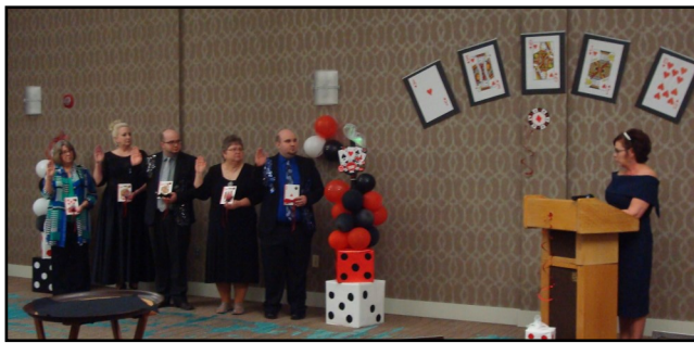
Swearing in of new officers