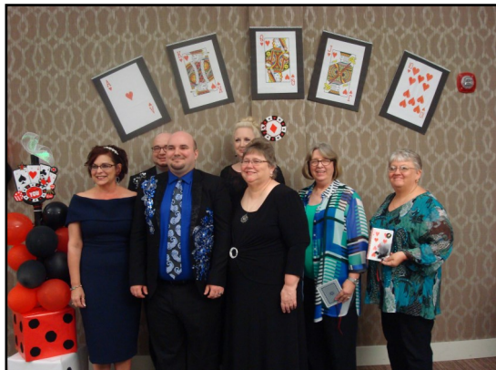
2017-2018 Executive Board