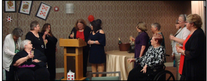
Past President's Toast