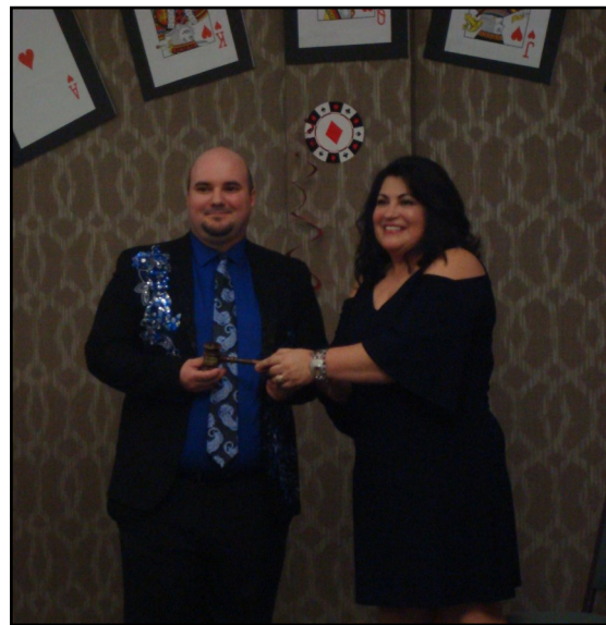
Passing of the gavel