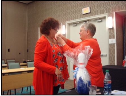
First time attendees pinning